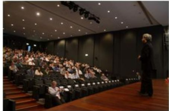
Plenary session of the TEMPMEKO 2013

The conference was attended by 291 scientific participants from 42 countries, who presented 177 oral presentations and 161 posters. Alongside with the excellent scientific program, 15 exhibitors/sponsors took advantage of this opportunity to present their equipment and services, as well as to establish personal connections with their customers from national institutes.