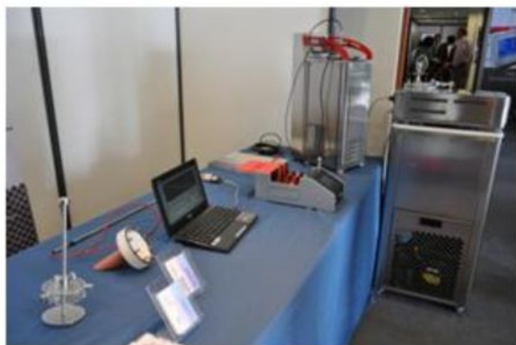
Equipment and software in action