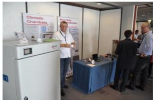
Batemika at the Kambic Metrology booth

Batemika Measurement Solutions attended the event and presented our latest developments together with our partner, Kambic Metrology. We used the event to make the first presentation of two of our new products.