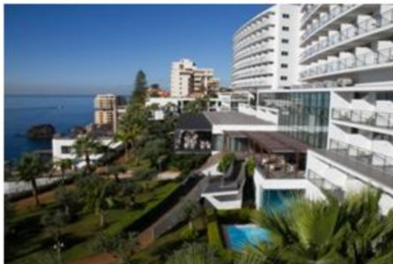
The conference with a view

TEMPMEKO, the international Symposium on Temperature and Thermal Measurements, is one of the most eminent events for sharing ideas, presenting new developments and meeting colleagues from the thermometry community. Its 12 th edition, the TEMPMEKO 2013 was held in Funchal, the capital of the Madeira Islands, Portugal, on October 14-18, 2013.