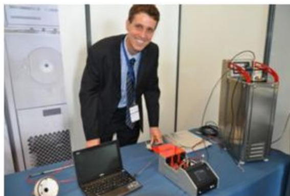
Do you need a thermometer readout?

Read more about our products and services at www.batemika.com .